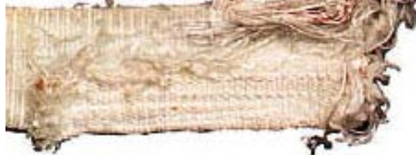
Illegible or Missing Tag