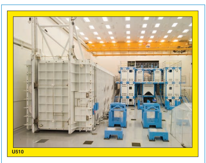
Figure 1. View of the OMEGA EP Laser Bay with the GCC on the left and the target structure on the right. The target area structure encloses the OMEGA EP target chamber.

The OMEGA EP target-area structure provides a stable mounting platform for the target chamber. This structure is also designed to suspend the beam-transport optics and provides interfaces for various diagnostics. The 7.6-m-high structure is constructed with a combination of large (8 in. \times 10 in.) vertical box beams, 8-in. horizontal I-beams, and constrained layer-damped shear panels. The shear panels provide efficient damping of the panel "drum-head" modes; constrained layer damping is incorporated into the panel design by sandwiching a layer of visoelastic polymer between two sheets of steel. As the steel sheets flex, the viscoelastic layer is sheared providing a high level of damping.