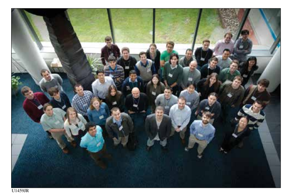
Figure 132.30 Nearly all of the 50 students and postdoctoral fellows who attended made poster presentations; 42 of these attendees received travel assistance from an NNSA grant. Travel assistance has already been arranged for the 2013 workshop. The workshop places tremendous emphasis on the participation and involvement of young researchers.

by travel grants from the National Nuclear Security Administration (NNSA). The content of their presentations ranged from target fabrication to simulating aspects of supernovae; the presentations generated spirited discussions, probing questions, and friendly suggestions. In total, there were 75 contributed posters, including 11 that focused on the Omega Facility. The invited and facility presentations, as well as OLUG's Findings and Recommendations, can be found at www.lle.rochester. edu/about/omega_laser_users_group.php.