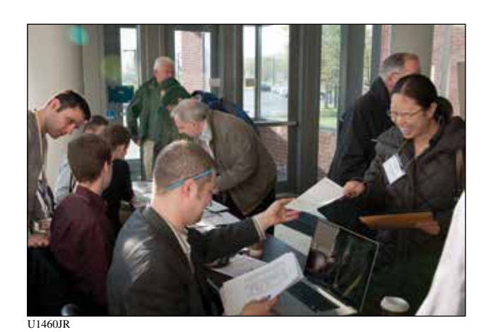
Figure 132.31 Registration for OLUG 2012 was a busy time. MIT's seven Ph.D. students worked the registration desk, demonstrating that they are capable of doing more than just physics!

Another important event at the end of the workshop was a panel of experts who gave an overview of the HED opportunities at national laboratories, universities, and LLE itself. These discussions are very useful for young researchers who may not know all the capabilities and HED research occurring at these different institutions.