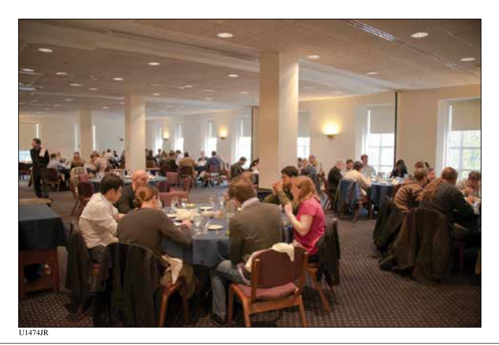
Figure 132.45 The banquet at the Meliora on the University of Rochester's campus offered workshop attendees a wonderful opportunity for socializing and good cuisine.